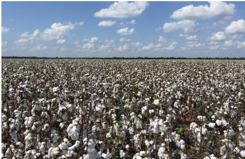
Cotton field