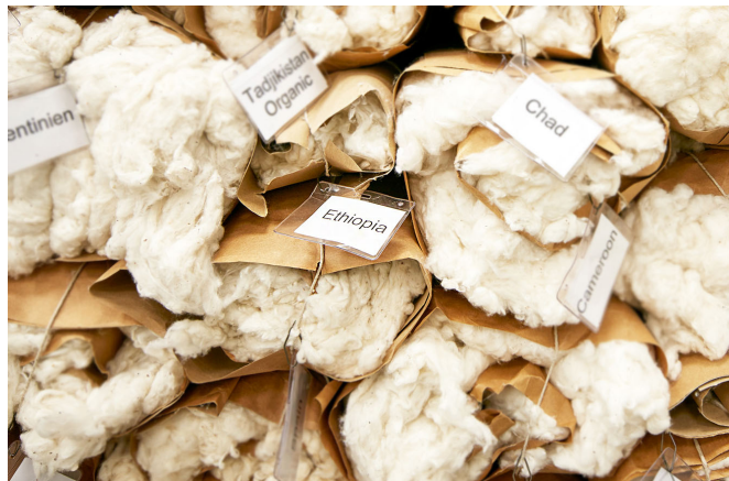
Cotton sample from Ethiopia in the standard room of the Bremen Cotton Exchange

“We chose Ethiopia as the guest nation in particular because it has both cotton production and an up and coming cotton processing industry,” says Axel Drieling from the Fibre Institute Bremen. “The country is currently going through an exciting economic transformation process in which cotton can play a major role,” adds Elke Hortmeyer from the Bremen